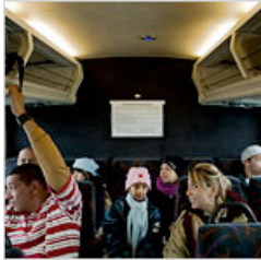
On the Outlet-Mall Bus, Checking Retail's Pulse