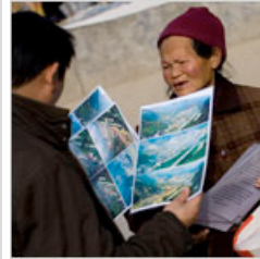
Romance Amid Chinese Quake Recovery Effort