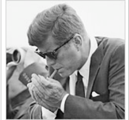
Lessons for Others in Obama's Efforts to Quit