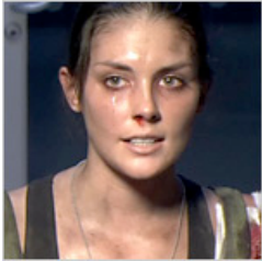
NBC Bridges Series Gaps With Online Minidramas